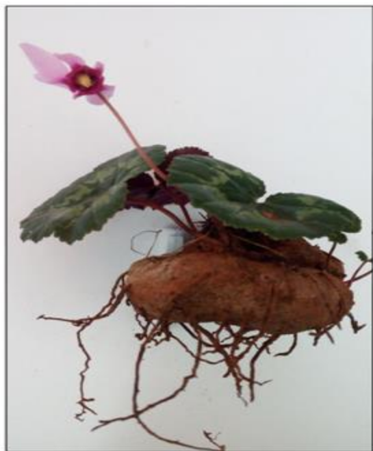
Figure (1): Cyclamen rohlfsianum .

The study was carried out in Biology Department/ Faculty of education / Omar Al-Mukhtar University. Plant washing (leaves- Tubers) with distilled water and dried inside the laboratory under room temperature, grinded by an electric grinder and saved for use.